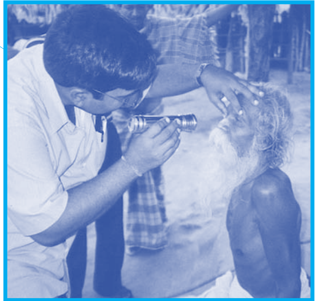
There are at least 6.7 million blind people in India, 6.9 million in China and 7.3 million in Africa.

The Rotary Club Host Program, a partnership of the FAAO and Rotary Clubs, provides ophthalmologists from developing nations with opportunities for ophthalmic education. Carefully selected guest ophthalmologists come to the US and spend the first week in the Rotary Club sponsor’s community learning from local ophthalmologists. The second week is spent at the AAO Annual Meeting attending instruction and skill transfer courses. Five international ophthalmologists participated in this program in 2005.